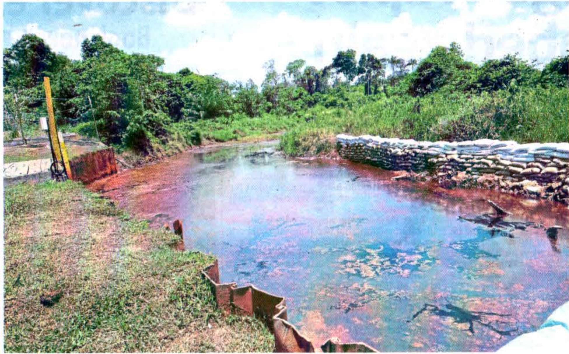
Critical: The low water level of Sungai Sedili Kecil at the Lok Heng water treatment plant.

"So why are we now told that there are cuts between April 18 and May 15?" she said.