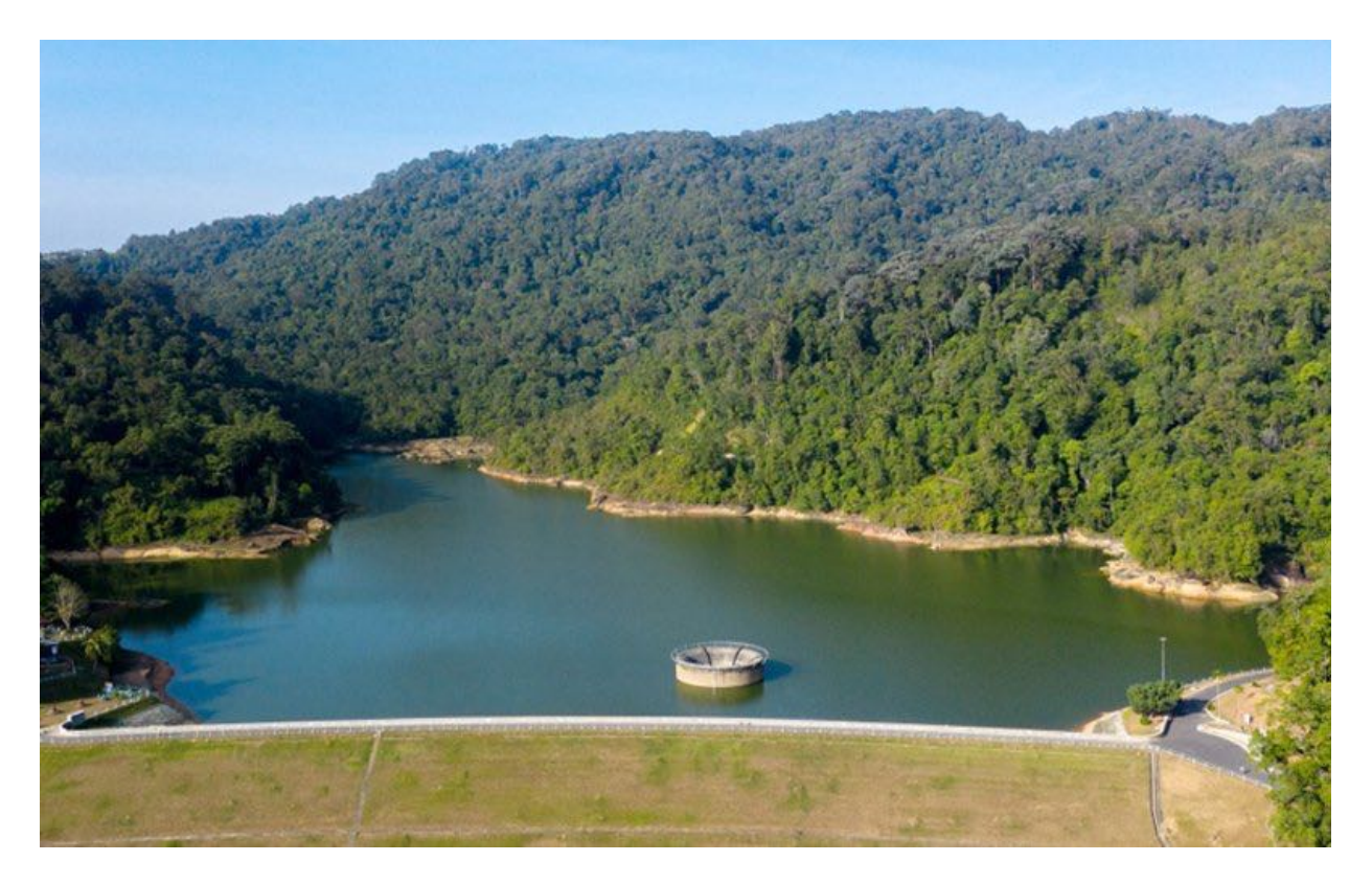
Penang's nine water treatment plants have a healthy reserve of 31% according to the water supply company.

GEORGE TOWN: A newly proposed water rate increase in Penang has received support from key interest groups, saying it would force Penangites to use less water.