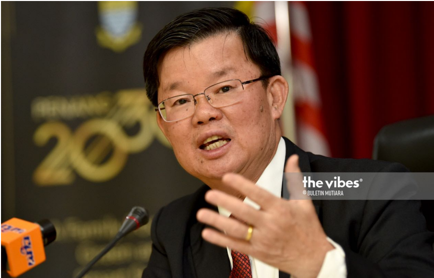
Penang Chief Minister Chow Kon Yeow says since 1973, Penang has been extracting raw water from Sg Muda without having to pay Kedah through the riparian rights. March 25, 2021

Sanusi had yesterday said that 14 large water tanks would be built along Sg Muda to ensure there is enough water for Kedahans and padi farmers along the river.