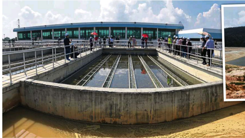
The third set of PTSP delivers treated water from the Sungai Dua Water Treatment Plant in Seberang Prai to Penang island.

“The commissioning of this third PTSP is our pledge to sustain continuous good water supply on the island now and in the post-pandemic recovery era.