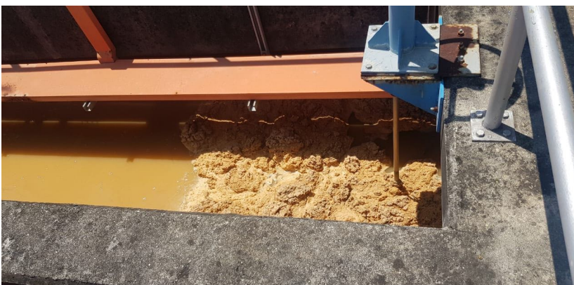
Mud sediments clogging up the treatment system. July 7, 2022

The state's water supply was hit by an inflow of muddied waters, which clogged the treatment system yesterday following the tragic flooding upstream of Gunung Inas forest reserve in Baling, Kedah last Sunday.