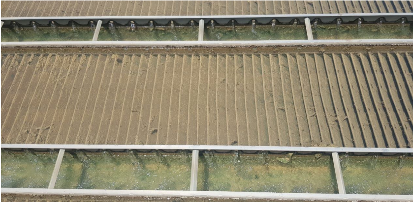
Treatment panels are left with stains due to the weather conditions and mud floods. – IAN MCINTRYE/The Vibes pic, July 7, 2022

It is learnt that the turbidity level of the raw water entering the plant here has skyrocketed to three times more than normal levels.